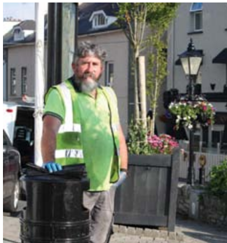
Volunteering in the Community & Volunteering in Heritage Photographic Exhibition