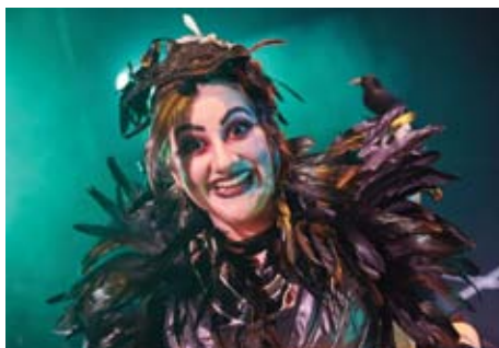
⊕ The Morrigan

From the Ice Age all the way to Ireland today and all in less than 90 minutes, with the same tongue-in-cheek humour Manny Man is known for. When it comes to fun history, Manny Man is your only man!